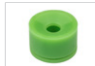
ADS2 Adaptor silicone, 19721409 Adaptor silicone for AUF1. For connection of transmission instruments with diameter of approx. 16 mm (green).