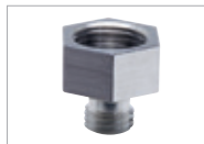
A801 Adaptor, 19721405 For use of AUF1 in combination with A105/1.