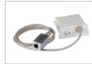
XKM RS232 10 Med Serial module, 19721432 Serial module