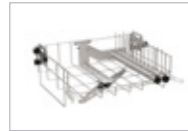
A105/1 Upper basket/injectors, 19721455 Loading: H 235, W 360, D 435 mm