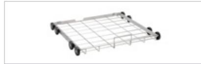
A151 Lower basket, 19721402 Vertical clearance: H 230 (+/-30)/H 210 with A102/A105/1. Loading: H 88, W 529, D 522 mm