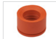
ADS3 Adaptor silicone, 19721410 Adaptor silicone for AUF1. For connection of transmission instruments with diameter of approx. 22 mm (red).