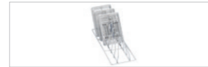
E198 insert 1/2, 19721419 For 6 mesh trays/kidney dishes. 7 holders (6 compartments). H 160, spacing 66,5 mm (compatible with mesh tray E197) H 160, W 180, D 495 mm