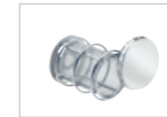
E473/2 Insert, 19721424 Mesh basket with lid for small parts. For hooking onto mesh trays. H 85, W 60, D 60 mm