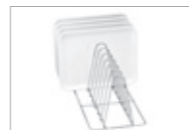
E130 Insert 1/2 for 10 trays, 19721415 11 holders (10 compartments). H 170, spacing 35 mm, H 180, W 180, D 445 mm