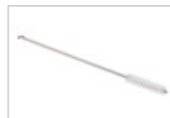
A804 Cleaning brush, 19721412 Twisted brush with spiral bristles for A800 central filter cleaning. Handle with grommet. Length 500 mm, Brush length 100 mm