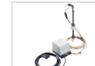
DOS K85/1 NER, 19721442 Dispenser module for Scandinavia