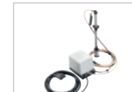
DOS K85/1 200-240V 50Hz, 19721435 Dispenser module