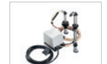
DOS K85/1 200-240V 60Hz, 19721443 Dispenser module