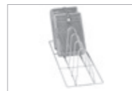
E131/1 Insert, 19721416 For optimum loading of 5 mesh and kidney trays. H 168, W 180, D 495 mm