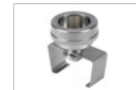
AUF1 Adaptor, 19721406 Sleeve for transmission instruments (see table at last page).