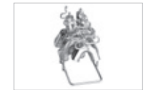
E522/1 Insert, 19721428 9 holders for dental impression plates. H 140, W 100, D 190 mm