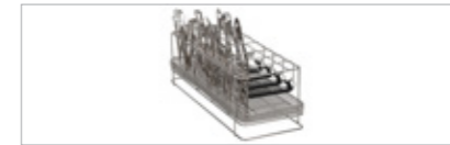
E337/1 Insert 2/5, 19721420 For instruments in upright position: 4 plastic receptacles, 12 compartments, approx. 22 x 28 mm, 4 compartments, approx. 25 x 28 mm, 48 compartments, approx. 13 x 14 mm H 113, W 173, D 445 mm