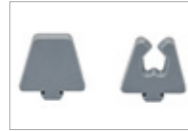
E476 Adaptor, 19721425 Adaptors for use in trays with 5 mm mesh. For transmission instruments with a diameter of 4 to 8 mm (50 per bag).