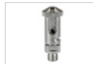
A814 Adaptor, 19721430 For reprocessing of various types of scaler tips. To be used on A105/1 upper basket.