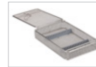
E197 Insert 1/6 mesh tray, 19721418 Wire mesh. Mesh size: Base 3 mm, sides 1,7 mm, lid 8 mm, H 42, W 150, D 225 mm