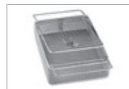
E146 Insert 1/6, 19721417 Mesh size: base: 3 mm, sides: 1,7 mm, lid: 8 mm, 2 hinged handles. For upper or lower basket. H 55, W 150, D 225 mm