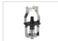
A803 Holder, 19721411 For transmission instruments (suitable for a wide range of various manufacturers) on A105/1 upper basket with A800 central filter.