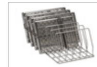
E523 Insert 1/2, 19721429 For mesh trays: 7 holders (6 compartments). H 145 Spacing 50 mm, H 151 W 220, D 450 mm