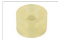
ADS1 Adaptor silicone, 19721408 Adaptor silicone for AUF1. For connection of transmission instruments with diameter of approx. 20 mm (white).