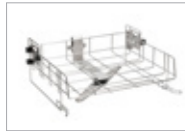
A102 Upper basket, 19721400 Loading: H 205 (+/-30), W 475, D 443 mm