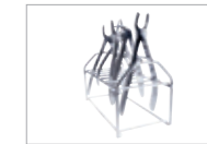
E521/2 Insert, 19721427 For 7 extraction or orthopaedic molar forceps. Compartment size 21 x 80 mm. H 135, W 100, D 189 mm