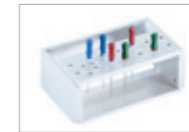
E520 Insert, 19721426 For 18 root canal instruments hinged. Can be sterilised in steam at 121°C/134°C. H 45, W 75, D 30 mm