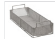
E379 Insert 1/2 mesh tray, 19721422 Wire mesh with 2 handles. Mesh size 1,7 mm, 80 (+30), W 180, D 445 mm