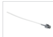
A815 Nozzle, 19721414 For the reprocessing of transmission instruments with an external spray channel. For use with A813 or A105/1 with A800 filter 4 nozzles with silicone hose.