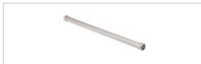
A800 Central filter, 19721404 Filter made from multiply stainless steel mesh for A105/1 upper basket. Mesh size 63 µm. Can be cleaned with A804 cleaning brush. L 405 mm, Ø 22.5 mm