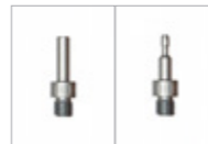
Adaptor, 06894700, 06895000 For W&H air scaler tips. For W&H Piezo and Prophylaxis tips. Can be connected to A813.