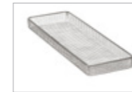
E430/1 Insert 1/3 mesh tray, 19721423 Wire mesh. Mesh size 5 mm H 40, W 150, D 445 mm