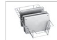
E339/1 Insert, 19721437 Insert for trays