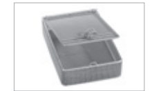
E363 Insert 1/6 mesh tray, 19721421 Mesh size 1 mm, with lid (without receptacles for instruments) H 55, W 150, D 225 mm