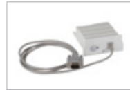
XKM 3000L Med Ethernet module, 19721433 Ethernet module