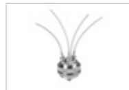
A813 Adaptor, 19721413 For reprocessing of up to 4 transmission instruments with external spray channel. To be used on A105/1 upper basket.