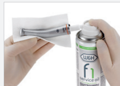
Perfect for manual maintenance W&H Service Oil F1 in the MD-400 spray can.

W&H dental drives achieve top speeds of up to 390,000 r.p.m. F1 provides excellent lubrication and internal cleaning thereby ensuring fault-free operation of the instruments.