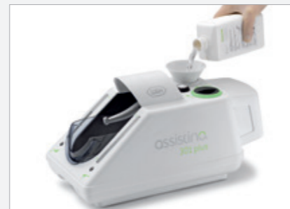
Perfect in the Assistina W&H Service Oil F1 in the MD-500 bottle for use in the Assistina.